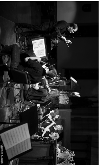
Symphony Number One at Emmanuel Episcopal Church, May 6, 2016.

Symphony Number One is devoted not only to commissioning and premiering substantial works by emerging composers, but also to recording and distributing these works for the public. In 2015, we recorded our debut album, followed by an EP, Emergence , each of which featured a stunning work for chamber orchestra by a compelling compositional voice. Now, for the first time, we are releasing a full-length album exclusively featuring emerging composers. More represents the best of Symphony Number One: three stimulating new works for chamber orchestra by a slate of three of the next generation's most promising voices, all lovingly prepared and performed in Baltimore.